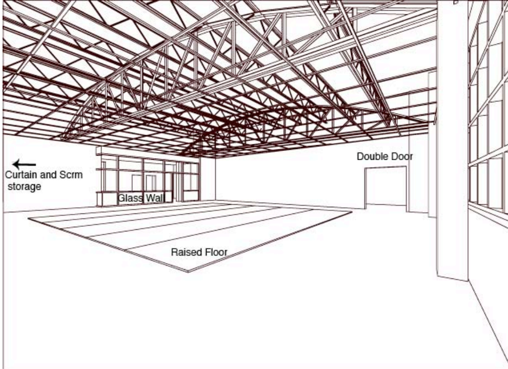
View from back stage left corner, looking front

For a complete list of equipment please visit our website http://accad.osu.edu/emma